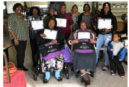
ReachUp Outreach in Caruthersville