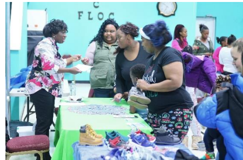
Healthy Start Community Baby Shower at CBC Family Life Outreach Center