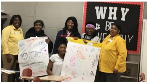
Youth at Sikeston High School