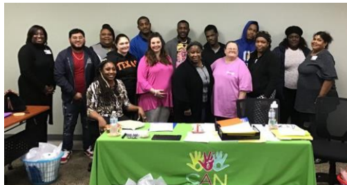
MBRC Office in Sikeston