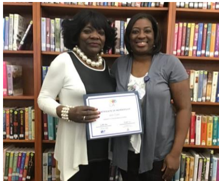
Sikeston Public Library