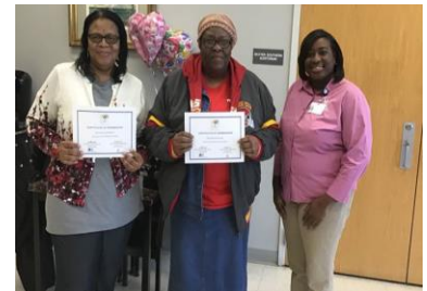
Caruthersville Public Library