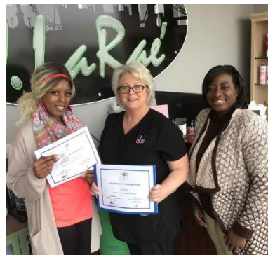
J.LaRae' Academy of Beauty Art