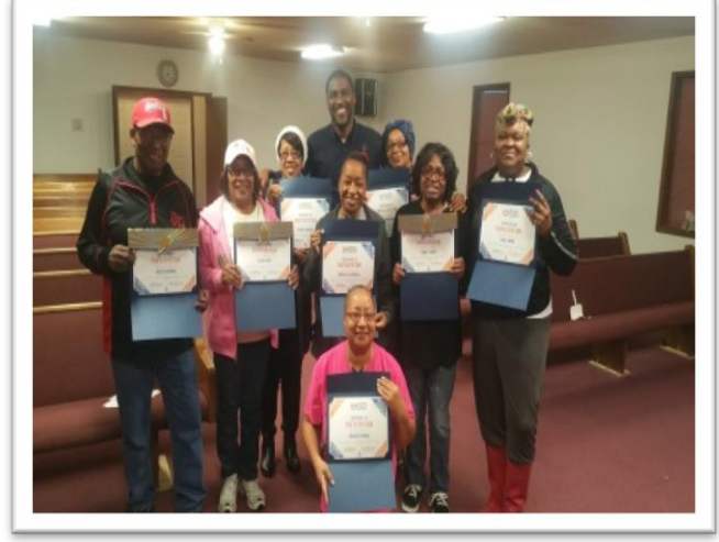
Church of Jesus Christ Congregational in Hayti, MO

Saint Mathews Baptist Church in Charleston, MO