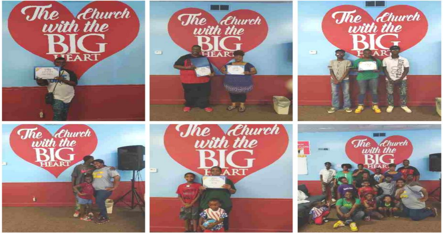
Agape Love Church on July 10 th -Sikeston, MO

Thank you to our contracted community health workers and partners for their efforts in making our classes a success.