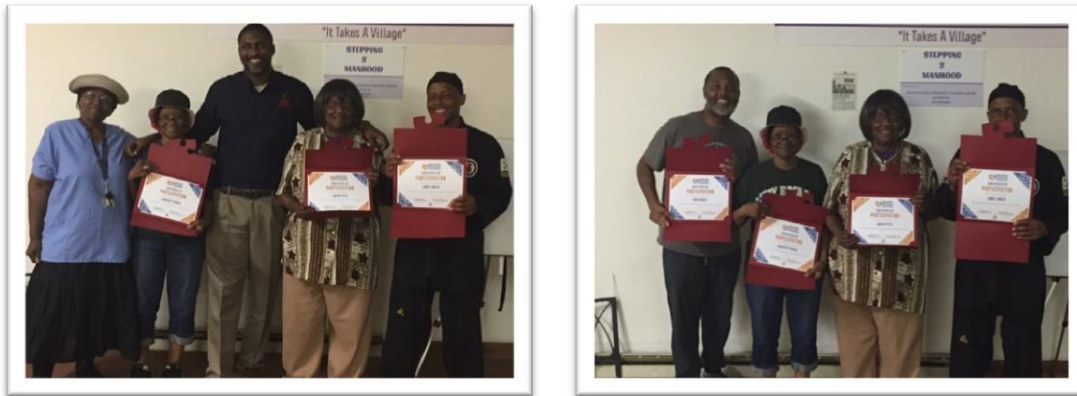
St. Luke Church on June 26 th - Hayti, MO